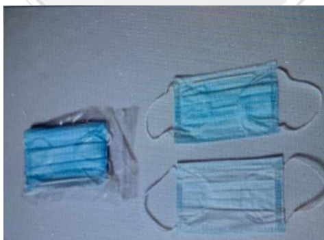
Photo of Samples

Note: Pass = Meet customer requirements; Fail = Fail customer requirements; # = No comment; N.D. = Not detected.